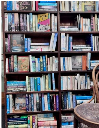
Photo from our Fiction Section

The Wireless Books radio show is still broadcasting on OAR 105.4 fm. Listen in at midday every second Saturday from 1 st June. We will be rebranding the show within the coming weeks.